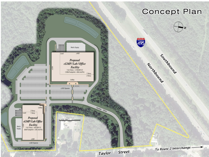
Littleton, Massachusetts Taylor Street